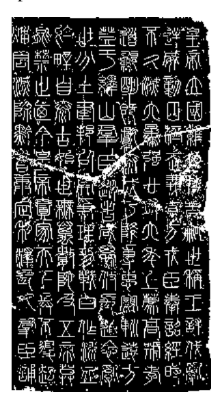
8:9 (Chín Inscription #1, SJ 6, first half, 0219).8 Long ago, in days of old, He came unto the Royal Throne. He smote the fractious and perverse, His awe was felt on every hand, Warlike and just, upright and firm.

Confucian ideas like just war did prove useful in portraying the unification process as a fully justified conquest. In 0219, the First Emperor visited the east. In a stone inscription set up on Mount Yì, his achievement is described thus: